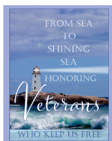
2025-2026 National Program Book