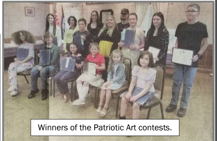
Winners of the Patriotic Art contests.