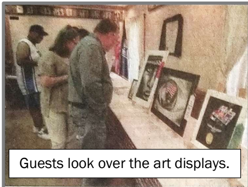
Guests look over the art displays.