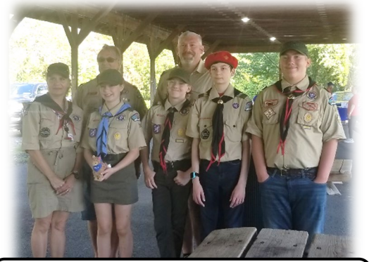
Boy Scout Troop helping out at the Carthage VFW Post 7227 Stop-22 Event.

The criteria utilized for this years' competition included type of event, number of participants, local media coverage, newspaper articles and photographs. State Commander Kell would like to thank all that participated in this year's very successful event.